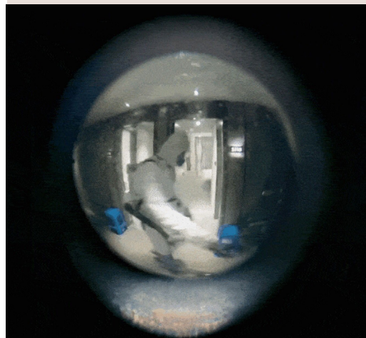
Image by Chiayu Hsu, Creepy future, via https://medium.com/the-creepy-future/memo-4-the-pure-blooded-elite-1e43252f5628

The virus mutation kept outpacing medical advances and humans had to live alongside the ever-evolving disease. Cities went into lockdown from time to time. Health code applied worldwide and became the new visa. People now take different drugs constantly to ease new symptoms. The abuse of chemicals brought physical malfunctions or even genetic disorders. Some nations resorted to the more extreme measure- genetic modification- to prevent generational extinction. The pandora's box had been opened. They promised an ultra-immune generation, but what occurred was more and more deformed human shapes, the most obvious side-effect of all, especially in poorer regions. In a world where almost everyone has been more or less altered biochemically or genetically, it's considered a great privilege to stay intact, to remain 'pure-blooded'. One needed